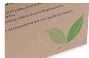
Color gradient print options available