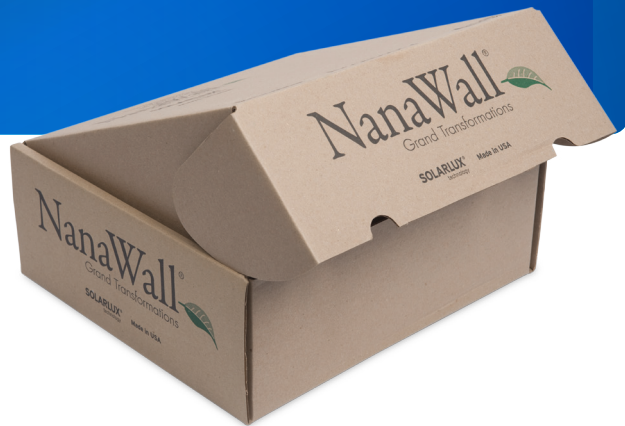
How much can you save using 1 ton of unbleached corrugated (about 2,000 12x12x12 boxes)?

EnviroKraft™ boxes made from post-consumer waste are reliable, cost effective and help to communicate an environmentally conscious message to customers.